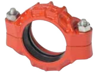
¾ – 12”/20 – 300MM SIZES

For 14 – 24”/350 – 600mm flexible roll groove systems, Victaulic recommends Style W77 AGS couplings. For more information, request submittal publication 20.03.