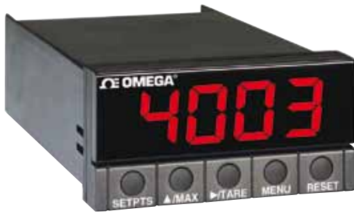
DP25B, shown smaller than actual size.