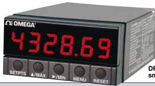
DP41-B, shown smaller than actual size.