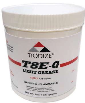
G.E. Ground Spec: 132T9986