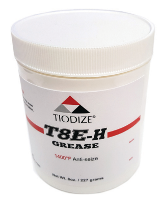
G.E. Aviation Spec: D6Y31C2 SAFRAN Spec: DMR75-905