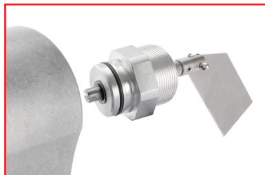
Device head can swivel and be pulled off