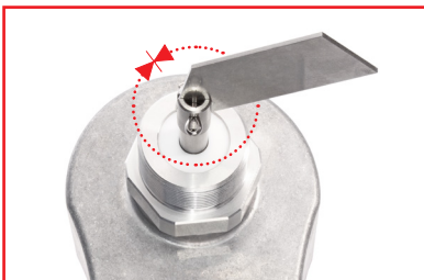
Rotation by 360° with reversal of direction of rotation