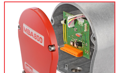
Selectable parameter sets