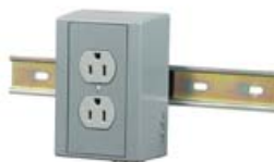
DIN Rail Utility Box